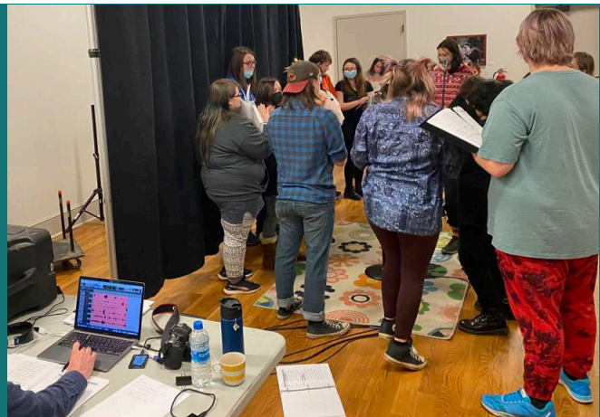
A Christmas Carol radioplay recording session

In December the Stuart's-sponsored Nelsonville-York Drama Club put on their first pre-pandemic production as a radio play of Charles Dickens the Christmas Carol. The performance was broadcast on WOUB throughout Athens County on Christmas Day.