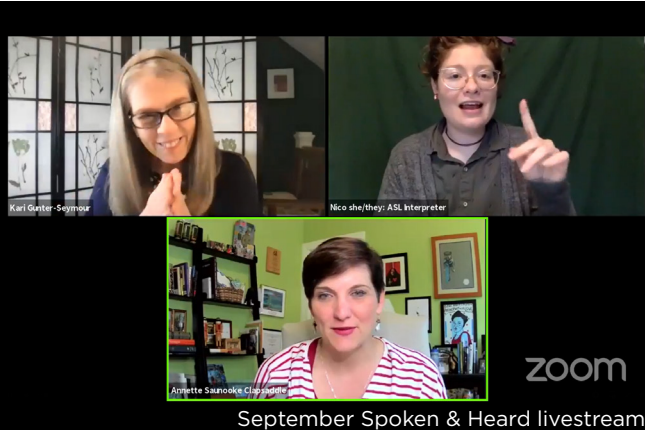
September Spoken & Heard livestream

The goal of our Arts Education department is to offer affordable, accessible broad-based programming focusing on visual and performing arts to people of all ages in our community and beyond.