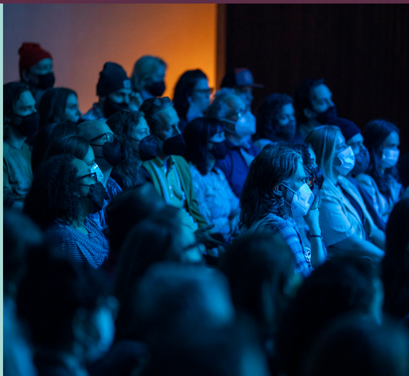
After a year of shuttered doors, audiences began returning to our historic theatre in Spring 2021.