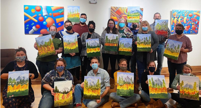
Paint & Pour participants show off their creations