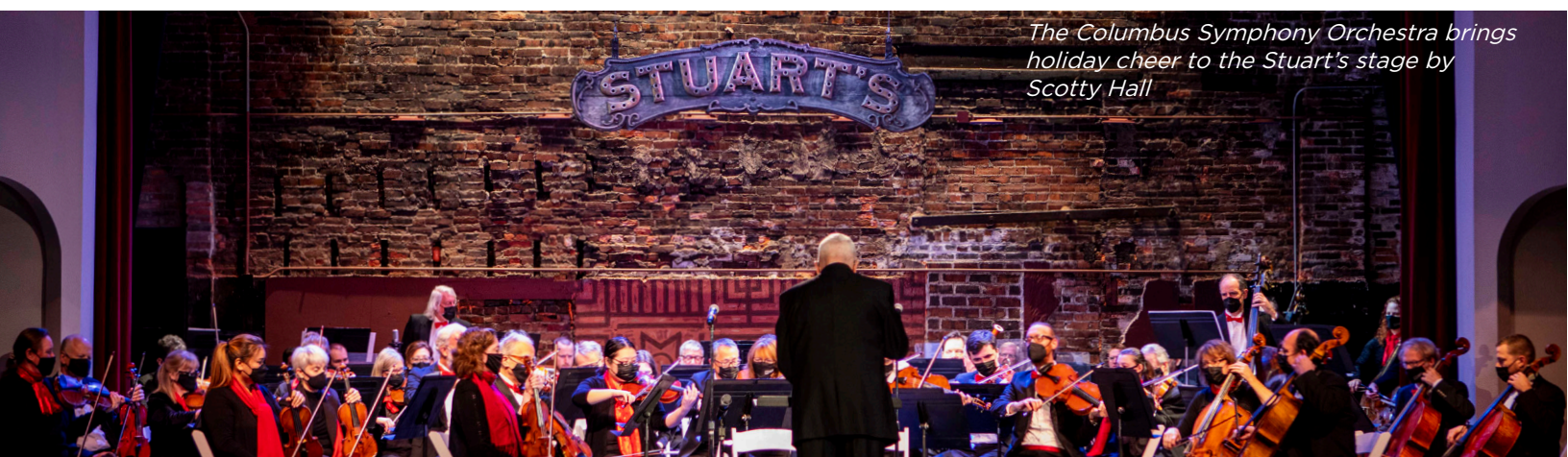
The Columbus Symphony Orchestra brings holiday cheer to the Stuart's stage